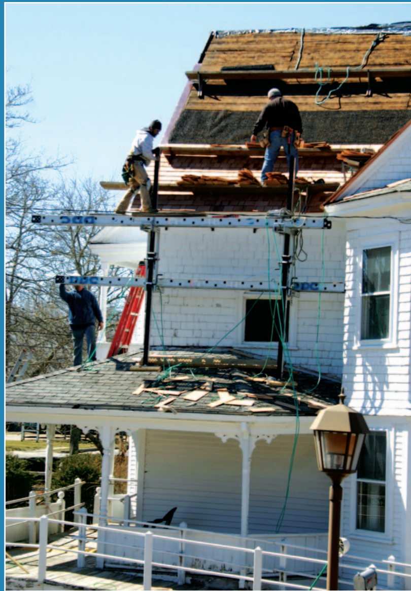
Workers were busy on Monday replacing the asphalt shingles on the roof of the historic Albro House, a town property located to the west of town hall, with a new cedar shingle cap.

transfer the caked vegetative material to the town landfill to be composted.